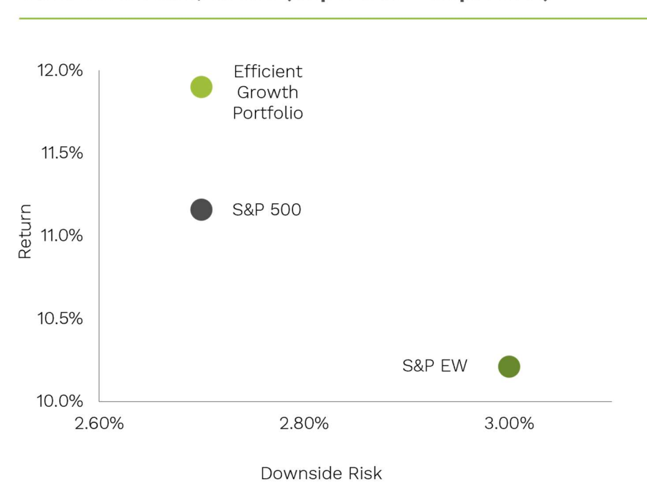
Risk vs. Return, Gross (Sep. 2013 - Sep. 2022)*

Below is a quick look at how Efficient Growth has performed through arguably the worst environment in history for a strategy focused on discipline, valuations, and risk. If a strategy can outperform with less risk through a horrible environment, how is it likely to fare through an ideal environment?